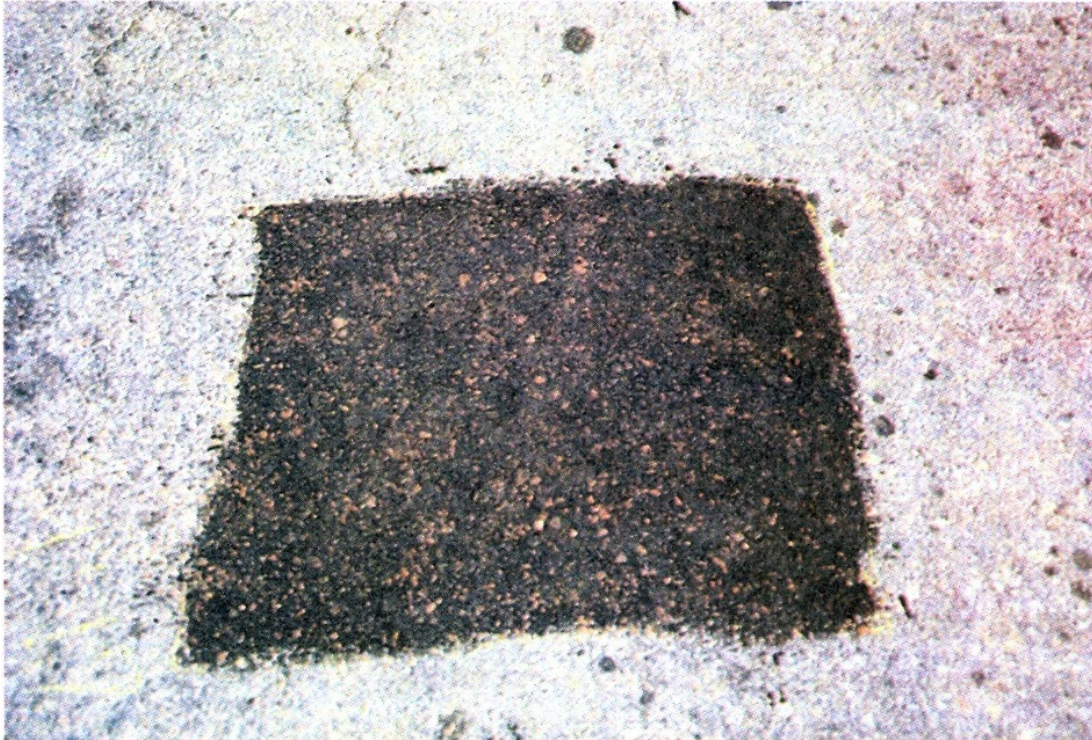
FIGURE 47-2 A: Total Penetration