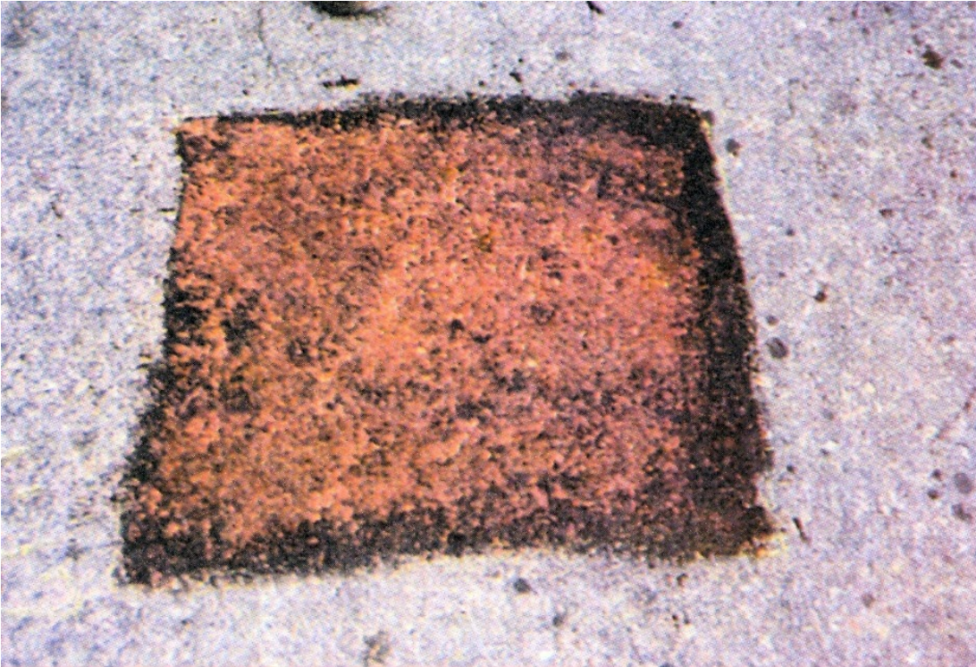
FIGURE 47-2 B: Partial Penetration